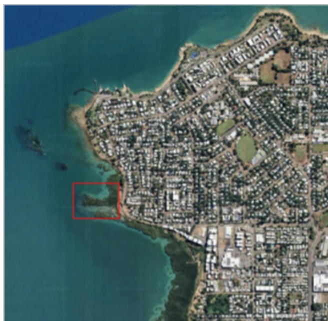
Figure 2: Location of World War II fish traps highlighted (red box).

The proposed location of the sign would be positioned to allow the reader to look out over the fish traps (Figure 2).