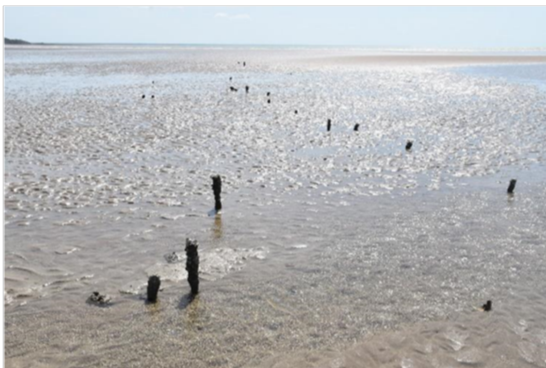
Figure 1: The remains of the World War II fish traps today.

The fish traps were established, maintained and utilised by No 54 Squadron. No 54 Squadron was primarily a Spitfire squadron. The traps provided the men with a fish supplement to their diets. It also provided the men with a crocodile free space to swim. An interpretative sign would highlight this little-known history.