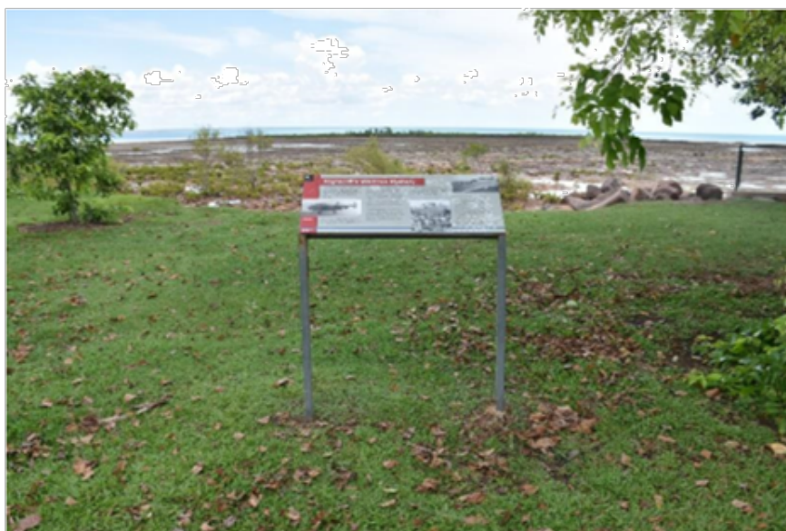
Figure 3: Signage at N5-140 B-25D Mitchell aircraft wreck.

The Heritage Branch can contribute the cost of artwork, layout, manufacture and installation of the sign. With the understanding that the ongoing maintenance would be facilitated by the Darwin City Council if this was agreed to.