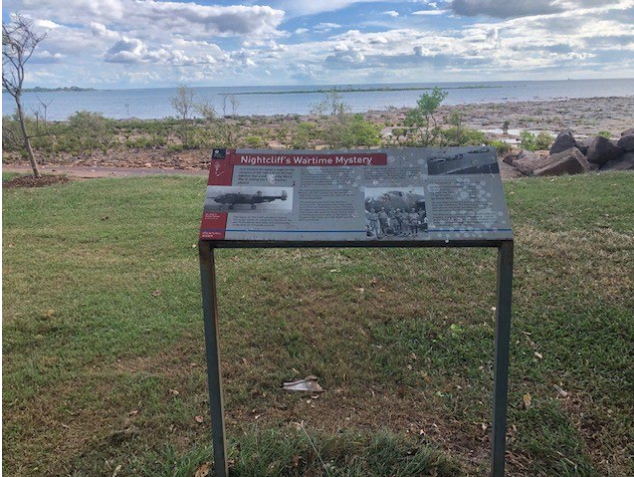
Interpretive sign at Sunset Park, Nightcliff foreshore

The sign would be similar to others along the Nightcliff foreshore, refer images below: