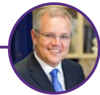
The Hon Scott Morrison MP Prime Minister of Australia

The Darwin City Deal is a ten year plan for Darwin's future, providing the vision and certainty to encourage broader investment in Darwin.