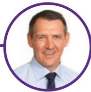
The Hon Michael Gunner MLA Chief Minister of the Northern Territory