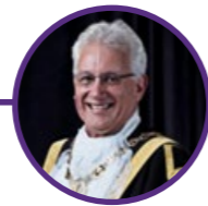
The Hon Kon Vatskalis JP The Right Worshipful The Lord Mayor of Darwin