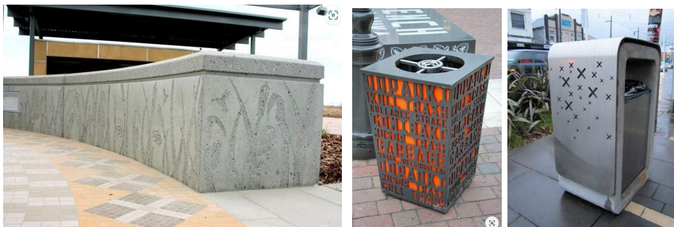
1. Universal Precast architectural concrete. 2. Trash can with text 'Garbage' in different languages, Poland. 3. XOXO, Hamilton, USA.

Vertical infrastructure: The integration of visual art onto the vertical plane of new construction. This could take the format of concrete stencil or laser cut screens.