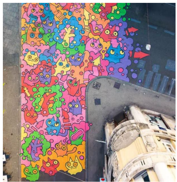
2. Everyday People , Slaven Lunar Kosanovic 2023, Zagreb. Croatia.