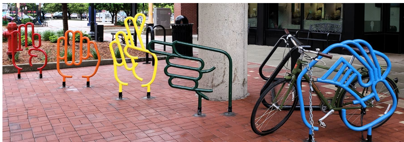
Jeff Knight's sign language bike rack functional art installation Fargo 2018.