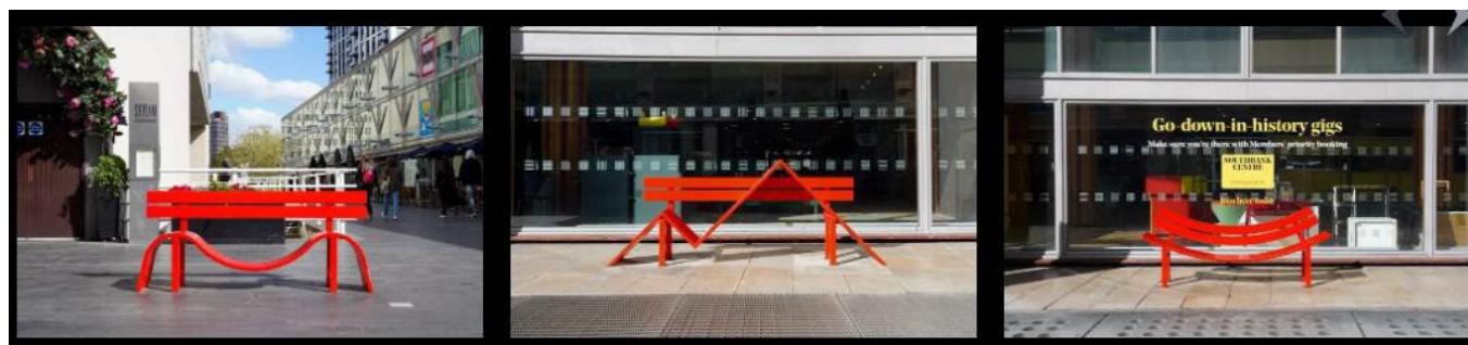
Modified Social Benches, Jeppe Hein, The Dipped One , The Pointy One , The Curved One .