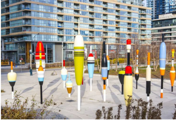
Douglas Coupland, Canoe Landing .