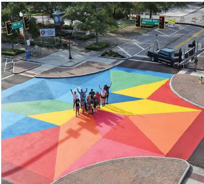
1. Intersection mural , Cecilia Lueza, Photo: Beth Reynolds.

Integrated visual art (horizontal road murals): Mural style visual artworks on roadways and pathways through various application methods.