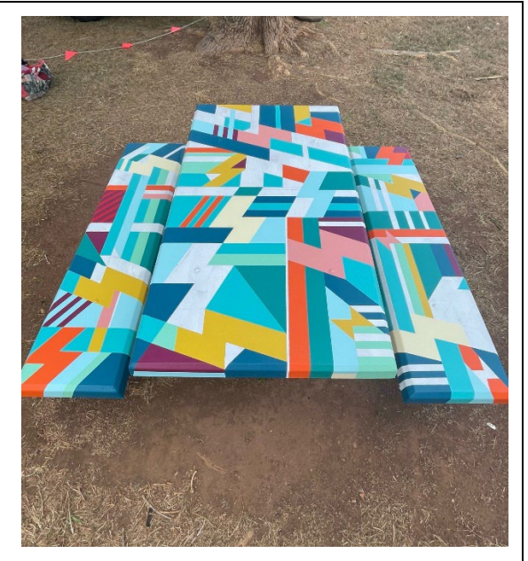
Artwork in progress, near Gun Turret