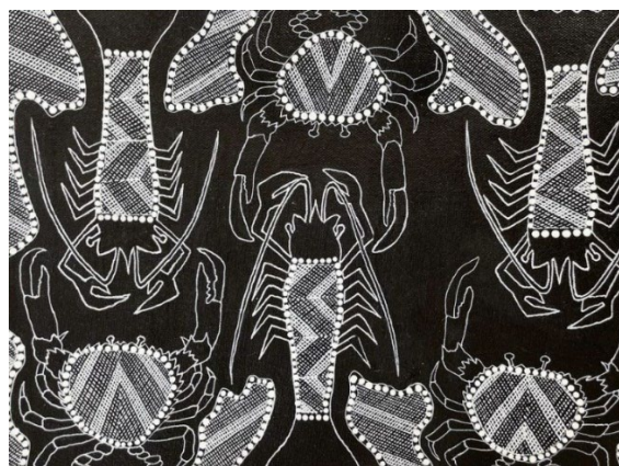
'Mudla (Crab) & Crayfish' original artwork, by Keelan Fejo. Artwork copyright agreement includes possible multiple uses across relevant projects, such as installation on identified Council building infrastructure, and may incorporate a range of colourways for distinctive variation. Monochromatic tones have been maintained for this project.