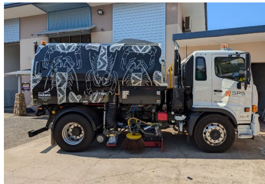
Completed installation of 'Mudla (Crab) & Crayfish' by Keelan Fejo on street sweeper October 2024.