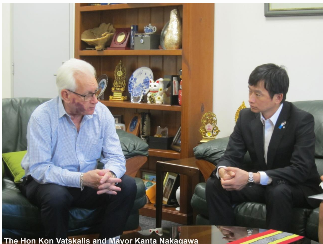
The Hon Kon Vatskalis and Mayor Kanta Nakagawa