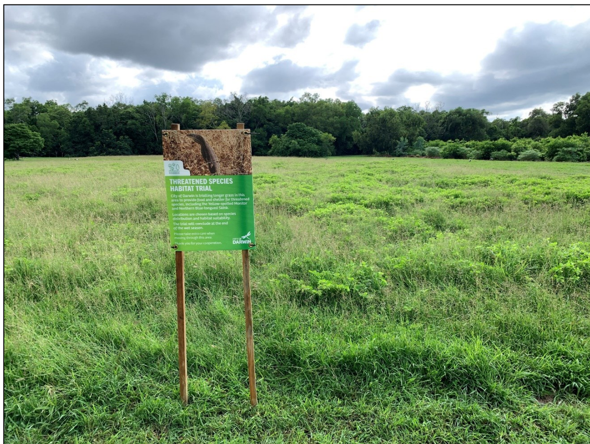
Image: signage in place at the trial site

The trial will conclude at the end of the wet season to limit any fire risks. Regular surveys of the area are being undertaken for weeds or any other concerns. Signage is also in place at the trial site to educate the community.