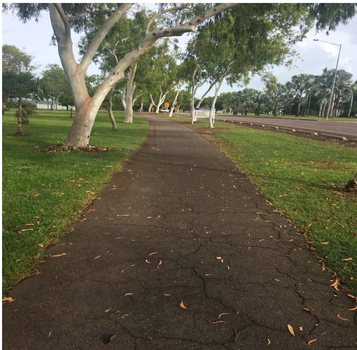
East Point Road – Path

In the revised Implementation Plan, there is an allocation of $48,000 in 2020/2021 to upgrade a section of the shared path along East Point Road. This project was also identified in 2019/2020 of the original Implementation Plan.