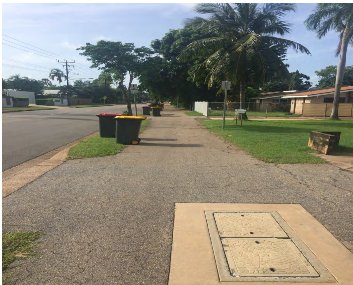
Dick Ward Drive – Path