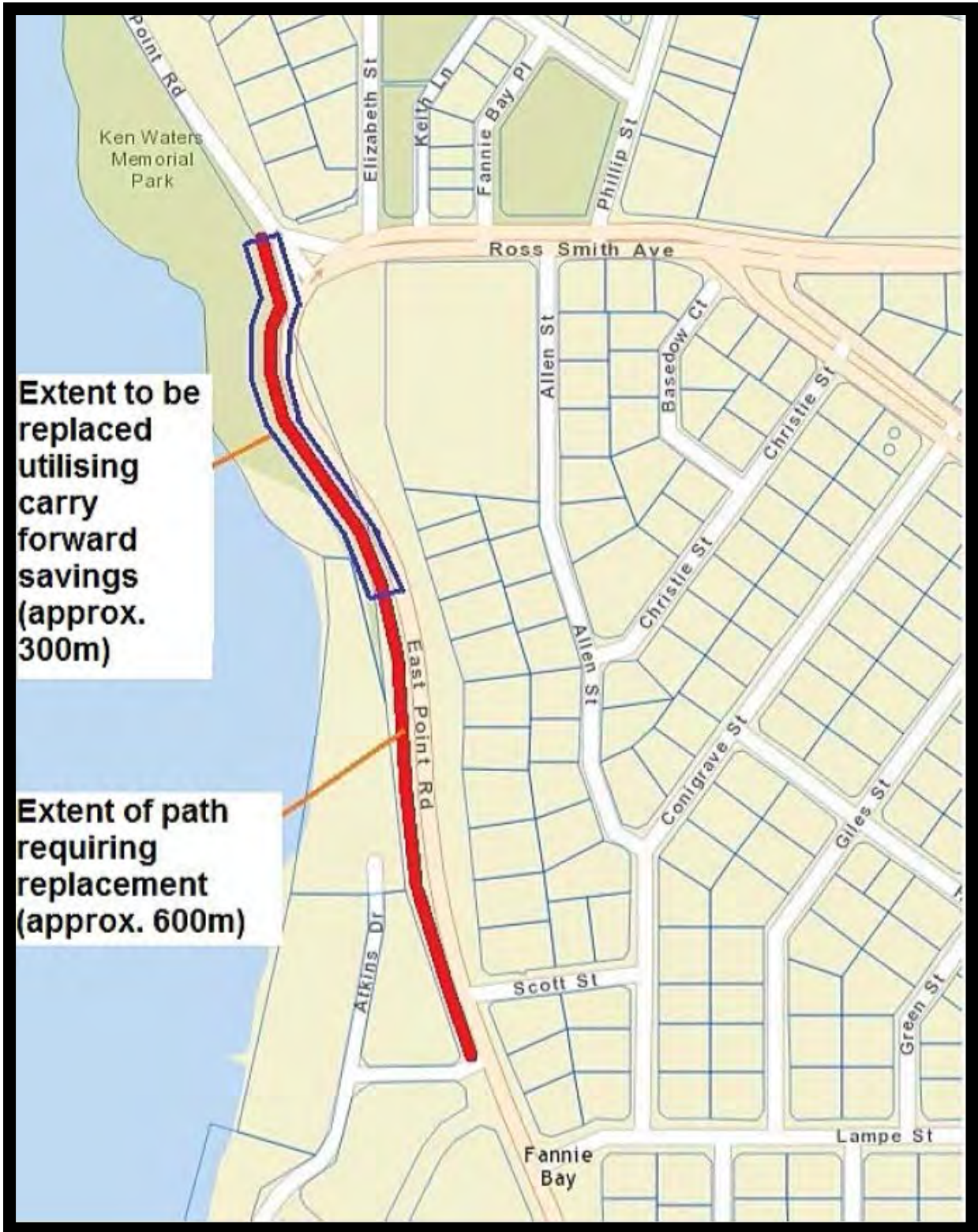
East Point Road Shared Path Renewal