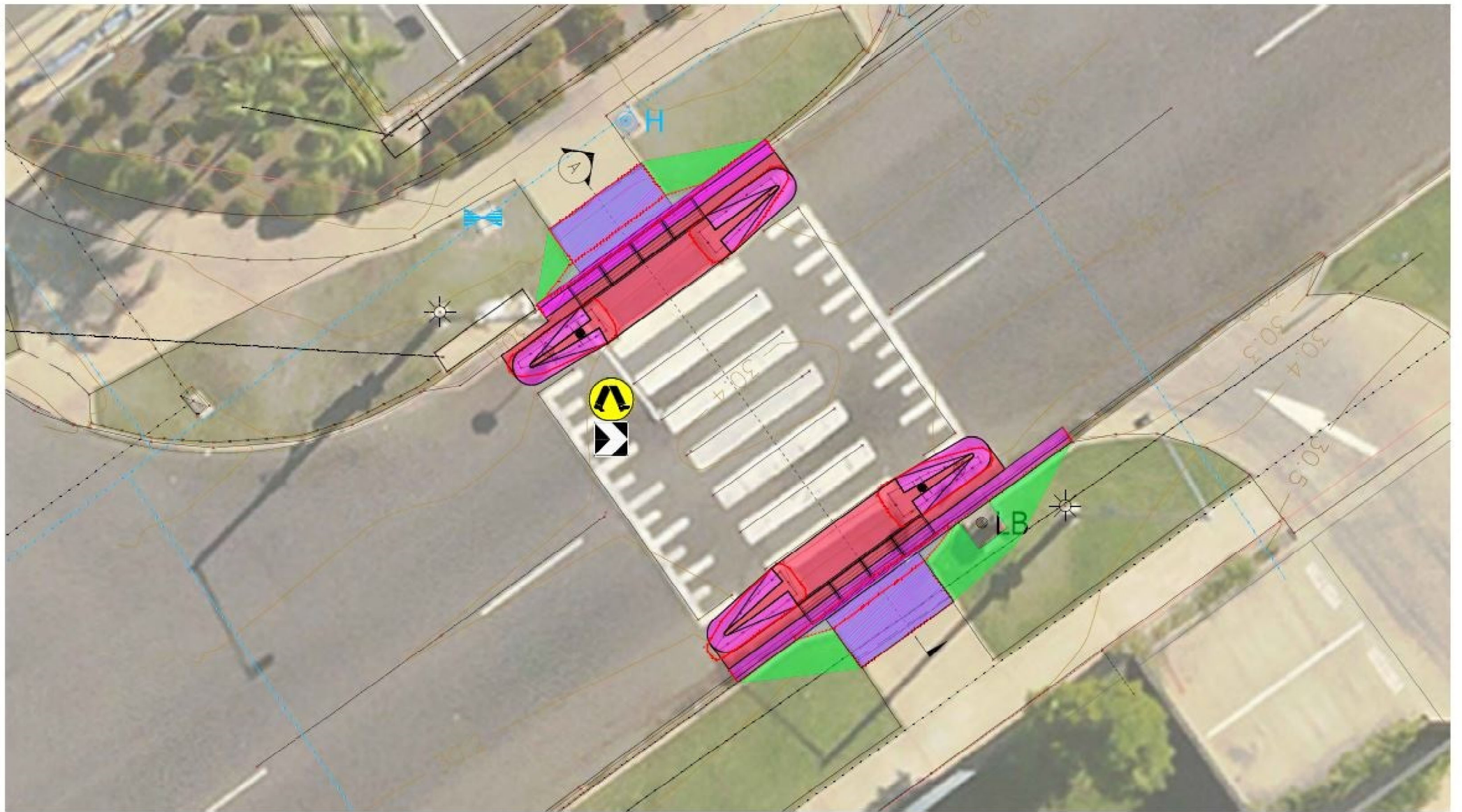
SKETCH PLAN - SITE 1 SCALE 1:50m (A1)