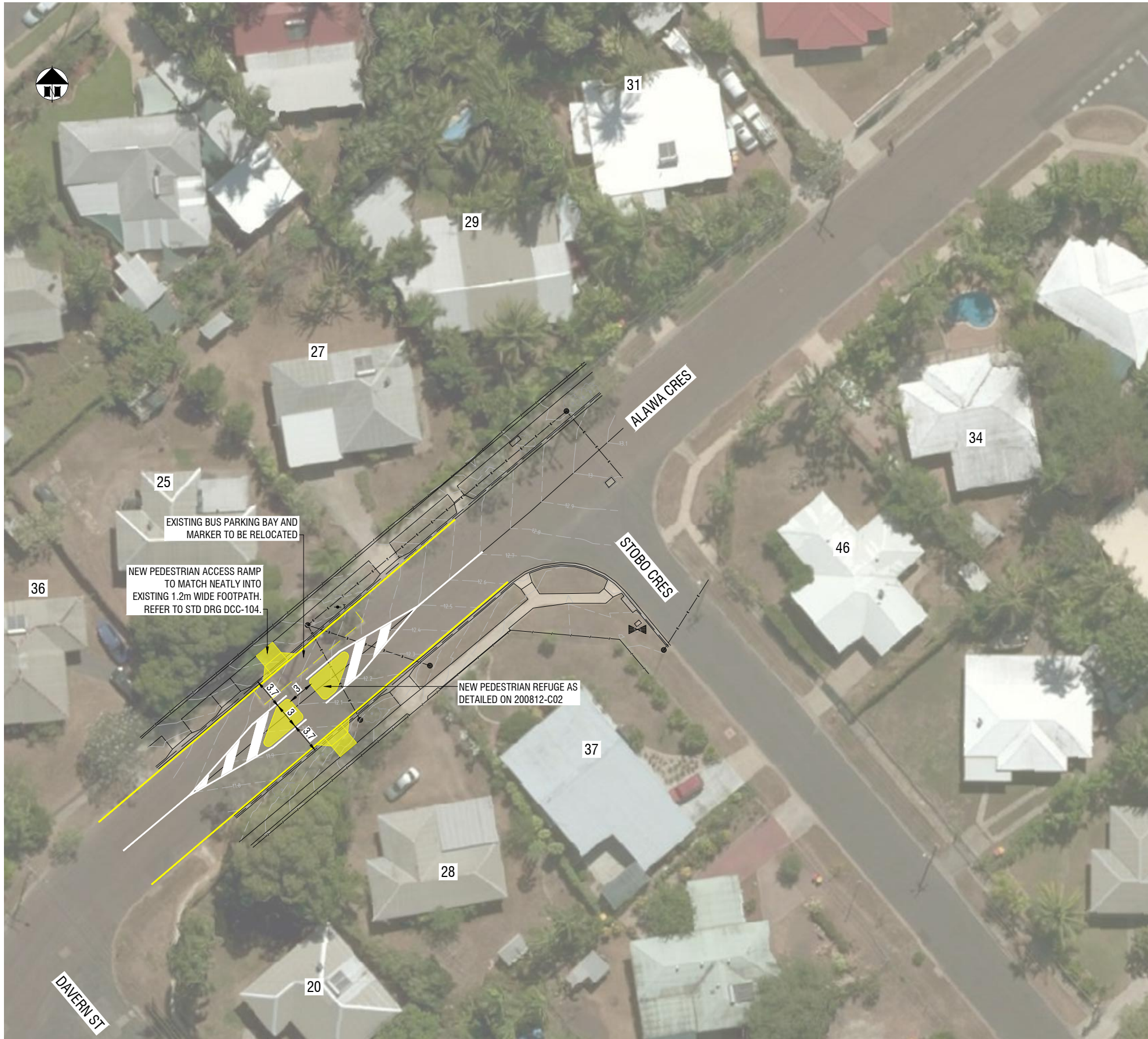
SITE 2 - ALAWA CR - PEDESTRIAN REFUGE SCALE: 1:250 @ A1