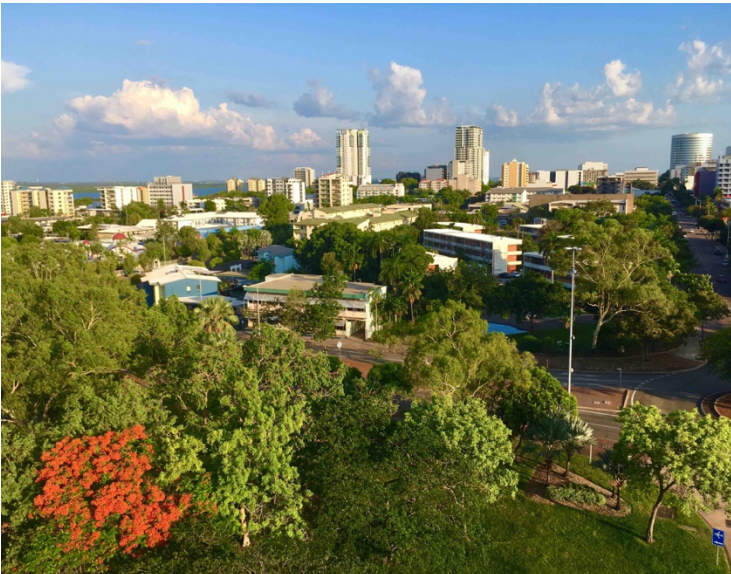
Darwin Urban Forest

To achieve the outcome of a stable tree that has a high resilience to cyclonic events requires attention to the entire life cycle of the tree. This starts with the selection of the most appropriate species through to the whole of life management of the mature tree. This report discusses the best practice options at each of the stages of plant selection, plant procurement and supply, tree installation, and whole of life tree management and provides many technical suggestions and recommendations to improve tree stability in storm events.