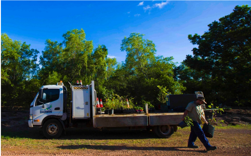
Increasing Canopy Cover

The tree inventory, data base and resultant improved planning will facilitate a shift from reactive tree management to a proactive modern urban forest model which will result in fewer customer requests, better tree health and structure and more cost-effective operations.