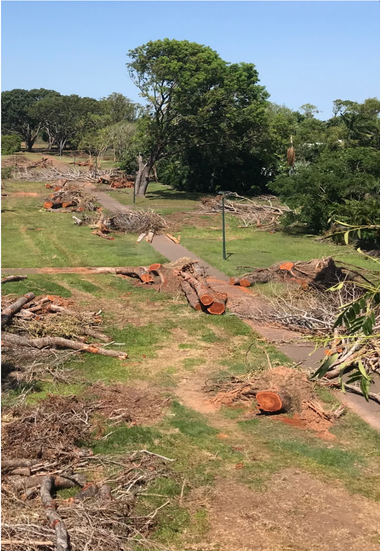
Cyclone Marcus 2018