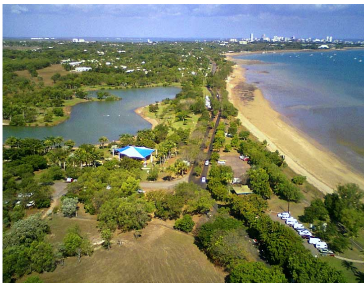
Lake Alexander Urban Forest