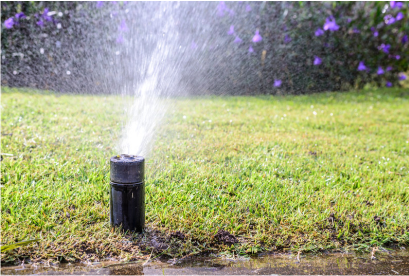
In Ground Irrigation