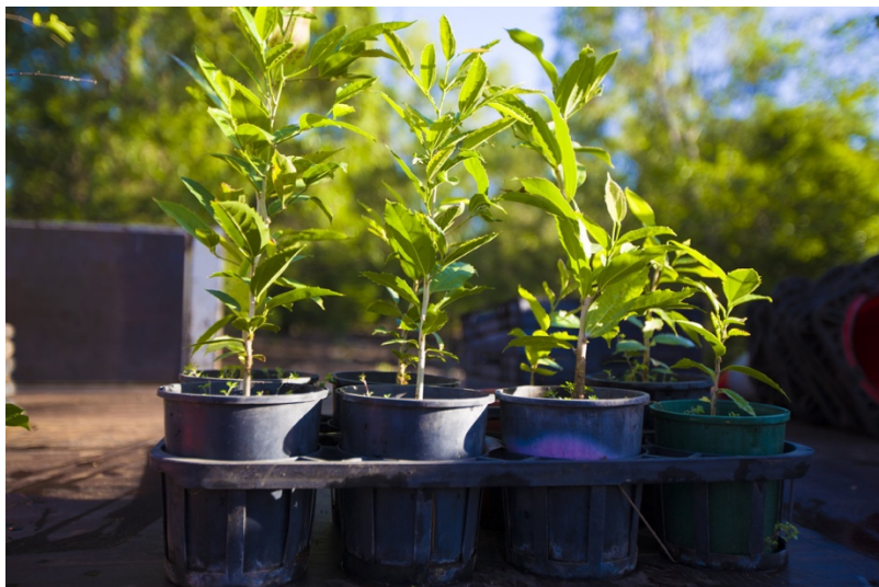
City of Darwin Nursery