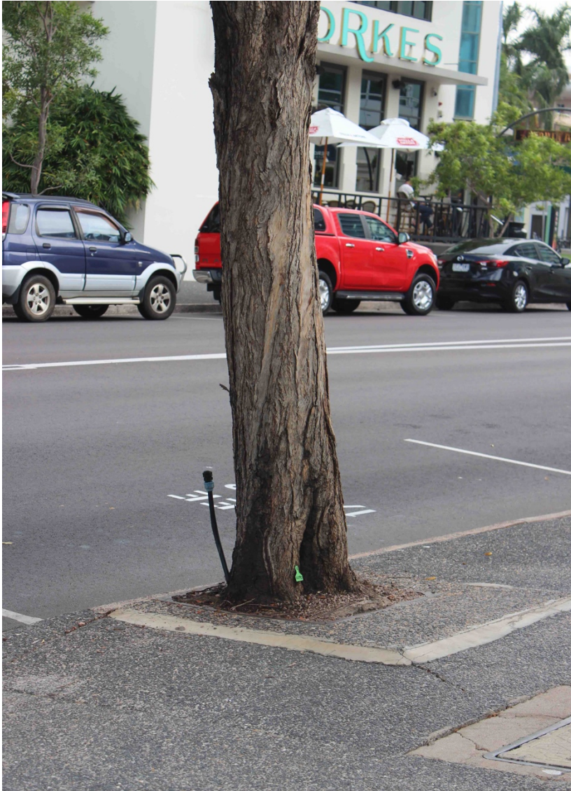
Trees and Services

Stormwater harvesting using storm water collection inlets should be installed wherever possible, and mandatory within the CBD. Water sensitive urban design options that relate to Darwin rainfall patterns can be considered to create a water bank, reduce runoff and optimise tree performance. Where tree pits utilise stormwater harvesting, they should also be connected to the stormwater system to ensure positive drainage is retained in tree pits to prevent waterlogging.