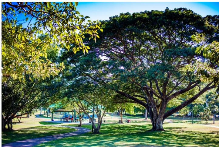
Jingili Water Gardens Urban Forest