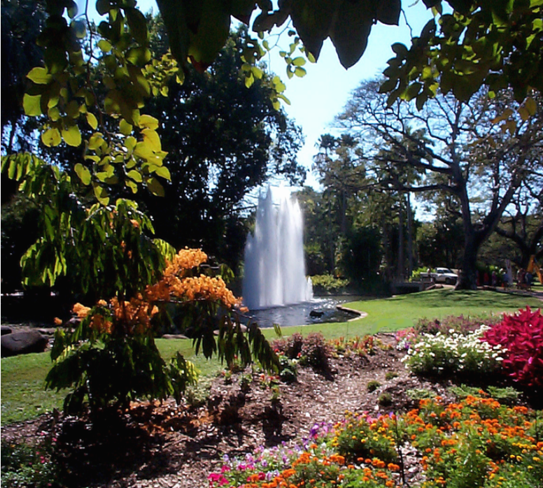
Darwin Botanical Gardens

Numerous studies within Australia and internationally demonstrate that well treed streets and suburbs are also those with higher property values. They are an investment with good returns for both private property owners and the community.