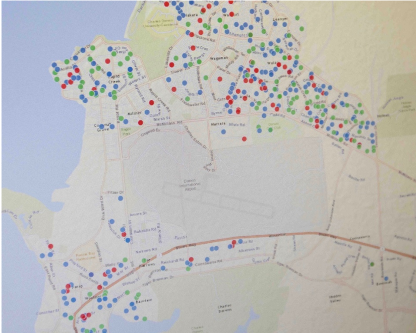
Location of trees affected by Cyclone Marcus 2018