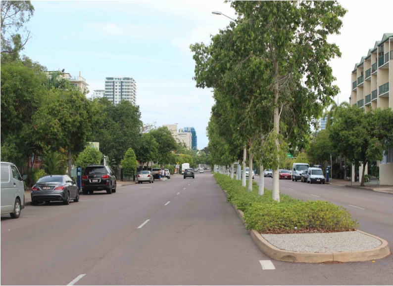
Tree Canopy Adds to Walkable Neighbourhoods

The consideration of tree selection in future climate change scenarios is of increasing importance. Will tree species planted today cope with the temperature, rainfall and storm events predicted under future climatic conditions predicted for Darwin? Kendal et al. (2017) provide data on the risk of temperature rises due to climate change on trees in the Darwin CBD. Alarmingly, all of the 41 tree species assessed were flagged as at risk with temperature rises under a 'business as usual' scenario by 2070. Climate change resilience has been included in the tree selection matrix in Appendix C. However, it must be noted there is a paucity of data available for tropical trees. Most of the species in Appendices A and B are City of Darwin as 'Unknown' for climate change resilience. This is an area in need of further research that could be carried out in Darwin.