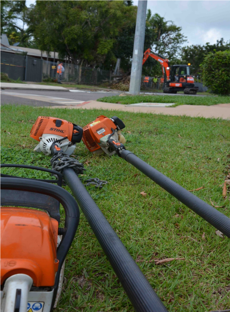
Maintaining the Urban Forest