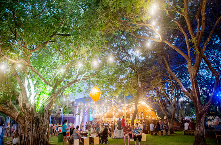
Physiological, sociological, economic and aesthetic benefits.