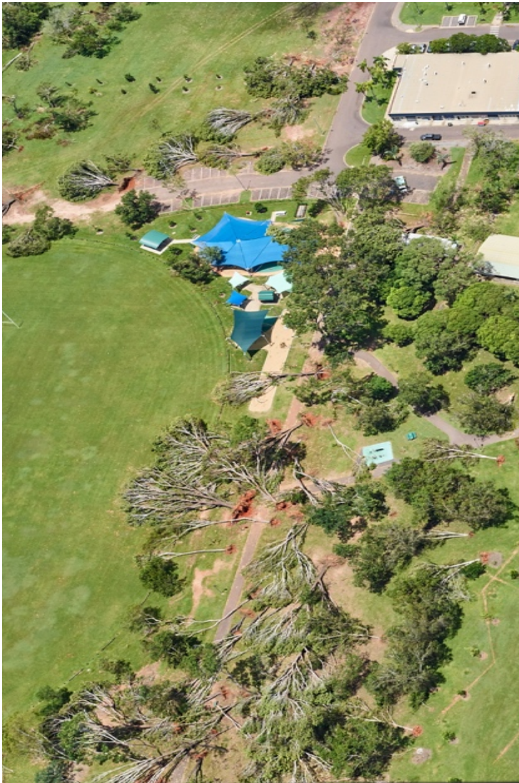
Cyclone Marcus 2018