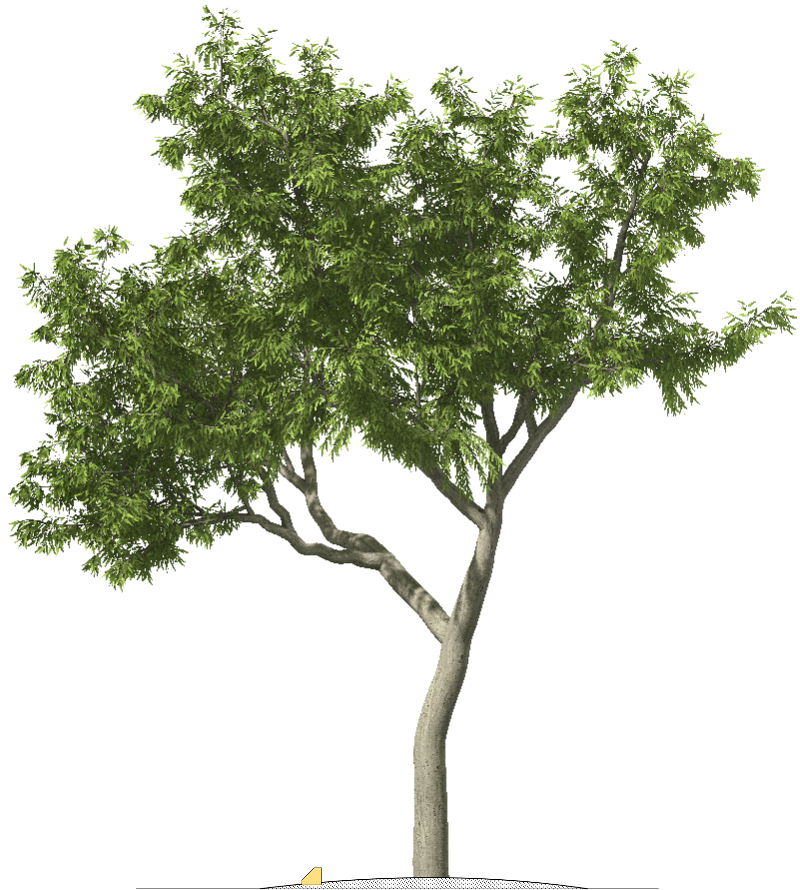
3 Memorial Tree Elevation