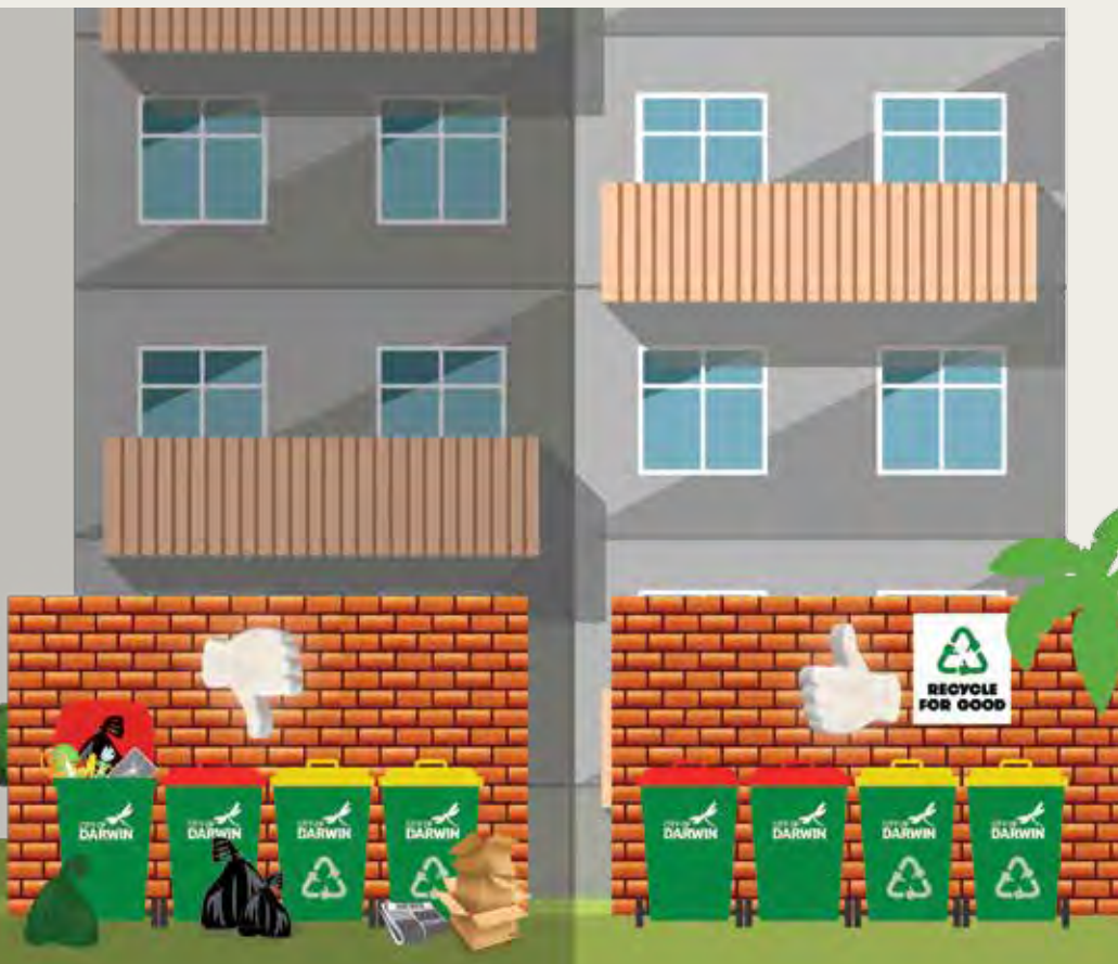
HOW TO USE YOUR BINS CORRECTLY