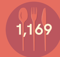
pieces of cutlery

City of Darwin believes that reusing our waste and diverting it from landfill is an environmentally sustainable change.