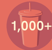
coffee and smoothie cups plus lids