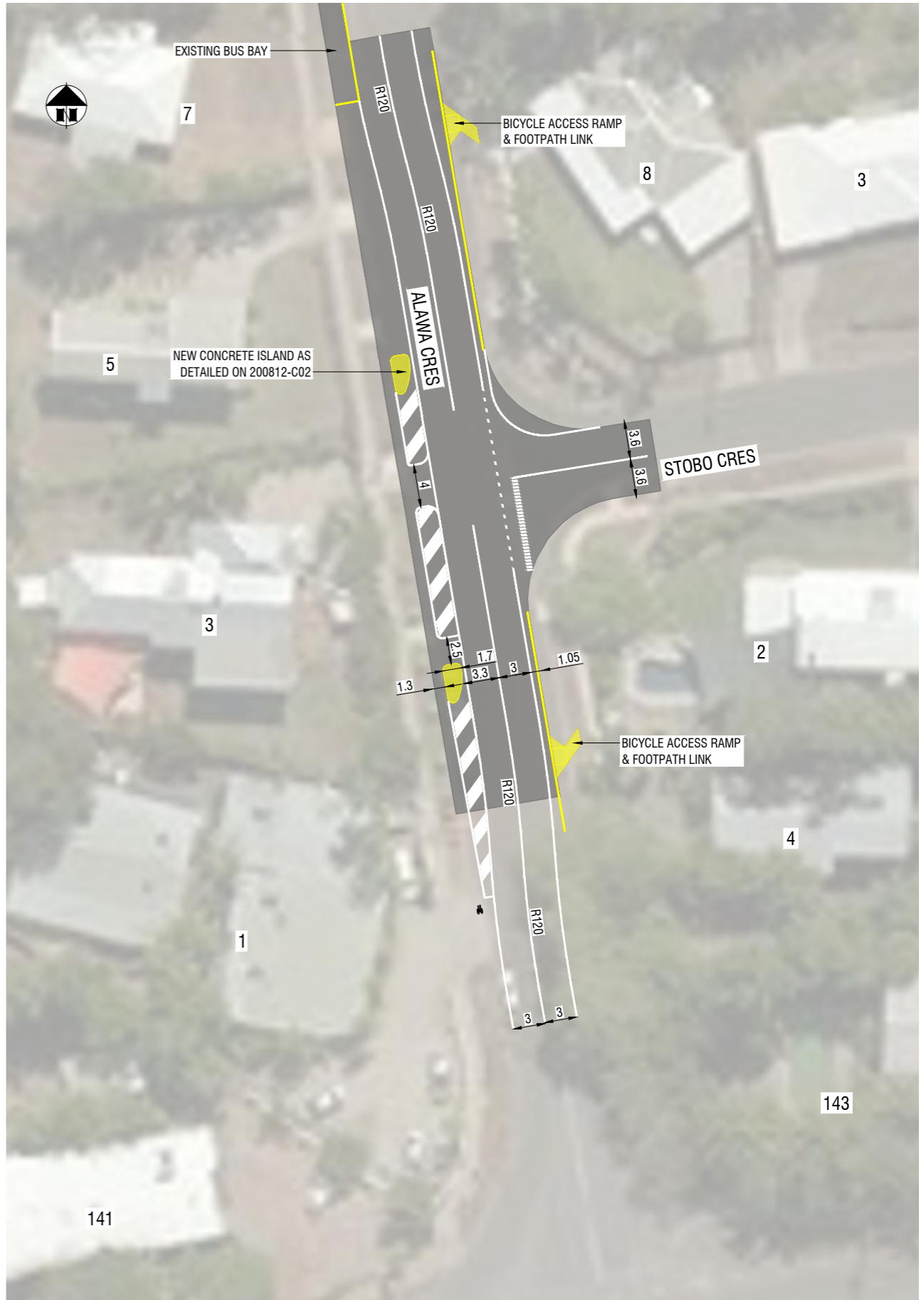
SITE 1 - ALAWA CR - STOBO CR INTERSECTION SCALE: 1:250 @ A1